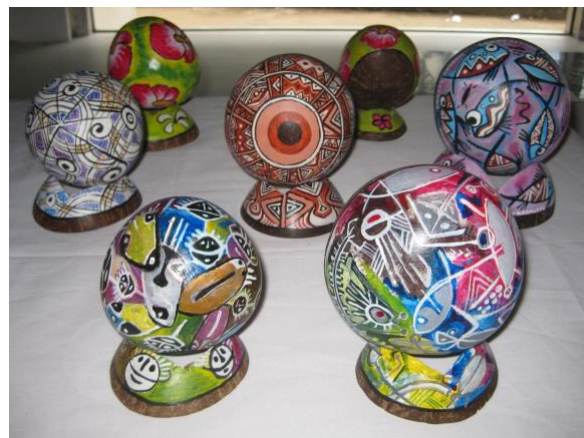
Fig. 3 Taitu Tensley Kuautonga, coconut shell kava cups, 2013