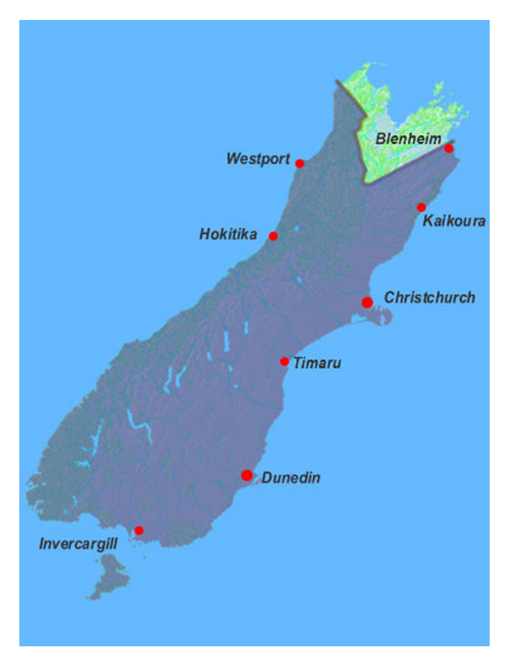
Fig. 1 Map of Te Waipounamu, the South Island of NZ

variety of reports that present a range of sometimes confusing data, particularly for social and/or cultural aspects of wellbeing. Furthermore, these existing data sources can be marked by systems of logic and methods of enumeration and categorisation that do not fully capture the sorts of data significant to iwi [tribal] cultural development in particular, or that are congruent with Maori ways of being in general (Kukutai and Rarere 2013, 2015; Kukutai and Walter 2015). This issue has also been noted for Indigenous peoples in other parts of the world (Axelsson and Skold 2011; Hamilton and Inwood 2011; Ziker 2011). Given that dependence on secondary data sources can be limiting, the Ngai Tahu people, through their tribal authority, have initiated research programmes and projects that aim to gather indepth, primary source data. Using the tribal authority of Te Runanga o Ngai Tahu (TRONT) as a case study example, this paper explores and compares data concerning Ngai Tahu wellbeing contained in two recently completed TRONT