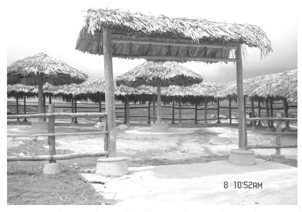
Figure 5: Unused new market, Ta Phin village, April 2010.

As a final note on Ta Phin, the most recent change in Ta Phin is the construction of a new handicraft market. Local residents and tour operators informed me that it was built by an international development agency, but at the time of writing no further details were known about the identity of the donor. Several resident women involved in handicraft production explained that it is unused, as they don't like the location on the outskirts of the village, where tourists rarely visit.