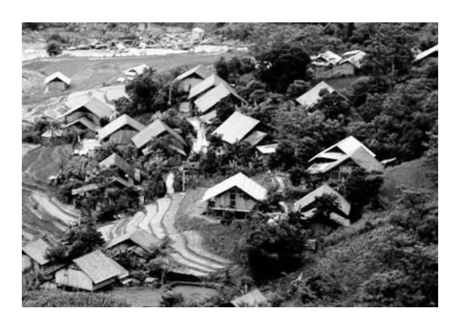
Figure 4: The village of Ban Ho in Sa Pa District

The village of Sin Chai did not prove to be successful as a homestay destination, due to poor connections with other trekking routes, its close location to Sa Pa town, and lack of involvement of the private sector in marketing (Duc, former SNV employee, pers. comm., 2010; Huong, 2006). The village of Ban Ho is a different story. Ban Ho is a village of 200 households, with a population of approximately 1200 people of the Tay ethnic minority (Huong, 2006).