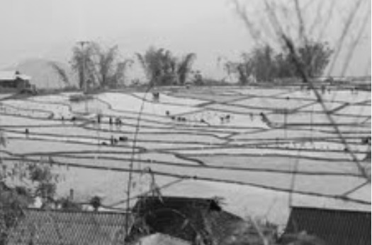
Figure 8 (left): Cultural performance in Chieng Yen commune. Figure 9 (right): Villagers planting rice in Chieng Yen commune.