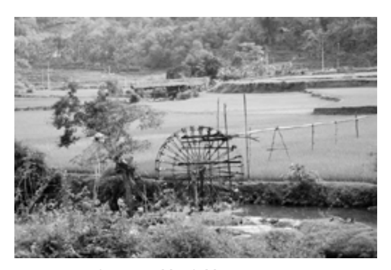
Figure 7: Farm irrigation of rice paddy field in Pu Luong Nature Reserve

of karst ecology" (FFI, undated a). The majority of PLNR residents are from the Thai and Muong ethnic minorities (Hien, development agency employee, pers. comm., 2010) and rely heavily on the reserve's natural resources. The District is one of the poorest in northern Viet Nam.