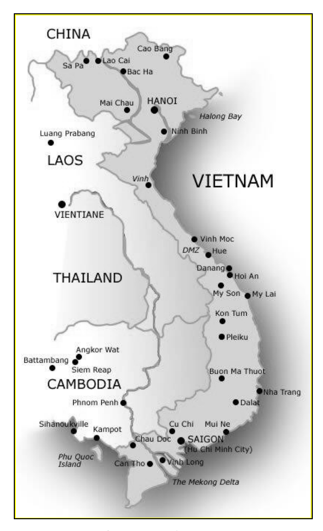
Figure 1: Map of Viet Nam

The Socialist Republic of Viet Nam is located to the east of the Indo-Chinese peninsula; with a land mass of 331,690km<sup>2</sup> and a coastline extending over 3000km.