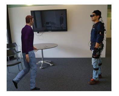
Figure 2: Illustration of what a user sees when immersed in an AR environment together with a virtual agent.