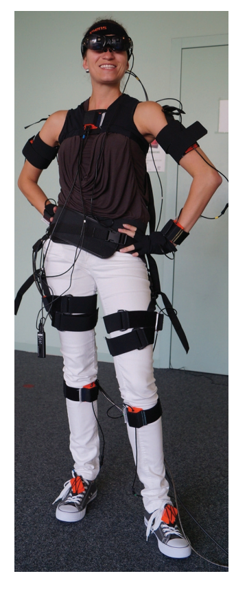
Figure 1: User wearing the proposed AR setup consisting of an inertial motion capturing suit and see-through HMD.

communication gap between users and computers. One key issue in this context is the credibility of the virtual agents as real persons. Researchers have investigated various solutions to this issue including high fidelity graphics [11, 8], human-like behaviors [4] and natural interaction between the agent and the user. However, whereas this issue has been thoroughly studied in the field of Virtual Reality (VR), virtual agents are rather new to AR environments [2, 6].