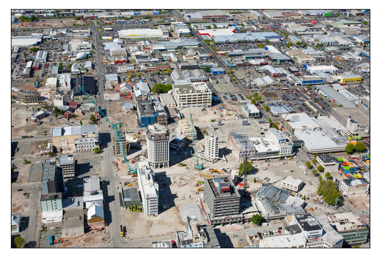
Figure 3. Aerial Photo of Christchurch Central Business District, October 2012