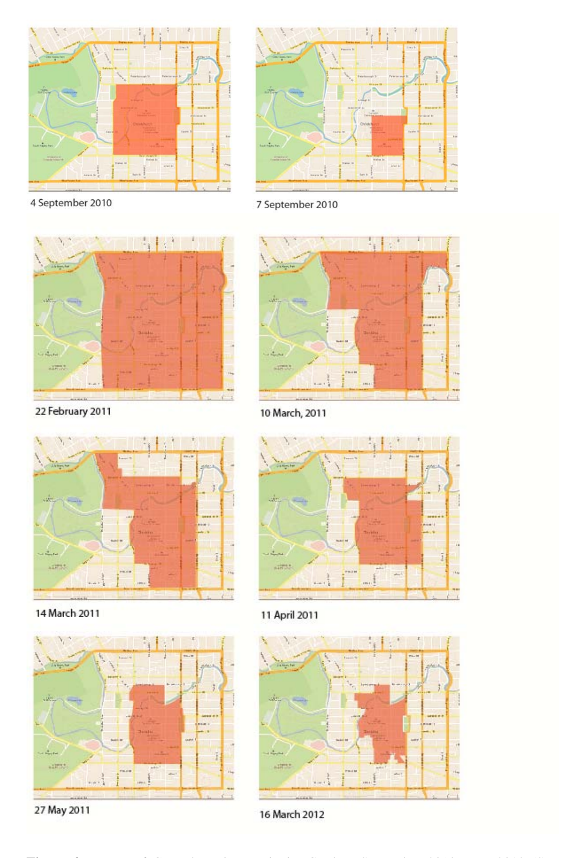
Figure 2. Extent of Central Business District Cordon, September 2010~May 2012