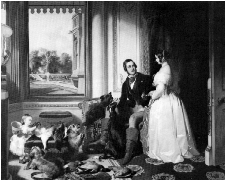
Figure 2. Windsor Castle in Modern Times , Sir Edwin Landseer (1841-45)

famous and reproduced portraits of the royal family, Windsor Castle in Modern Times (Figure 2).