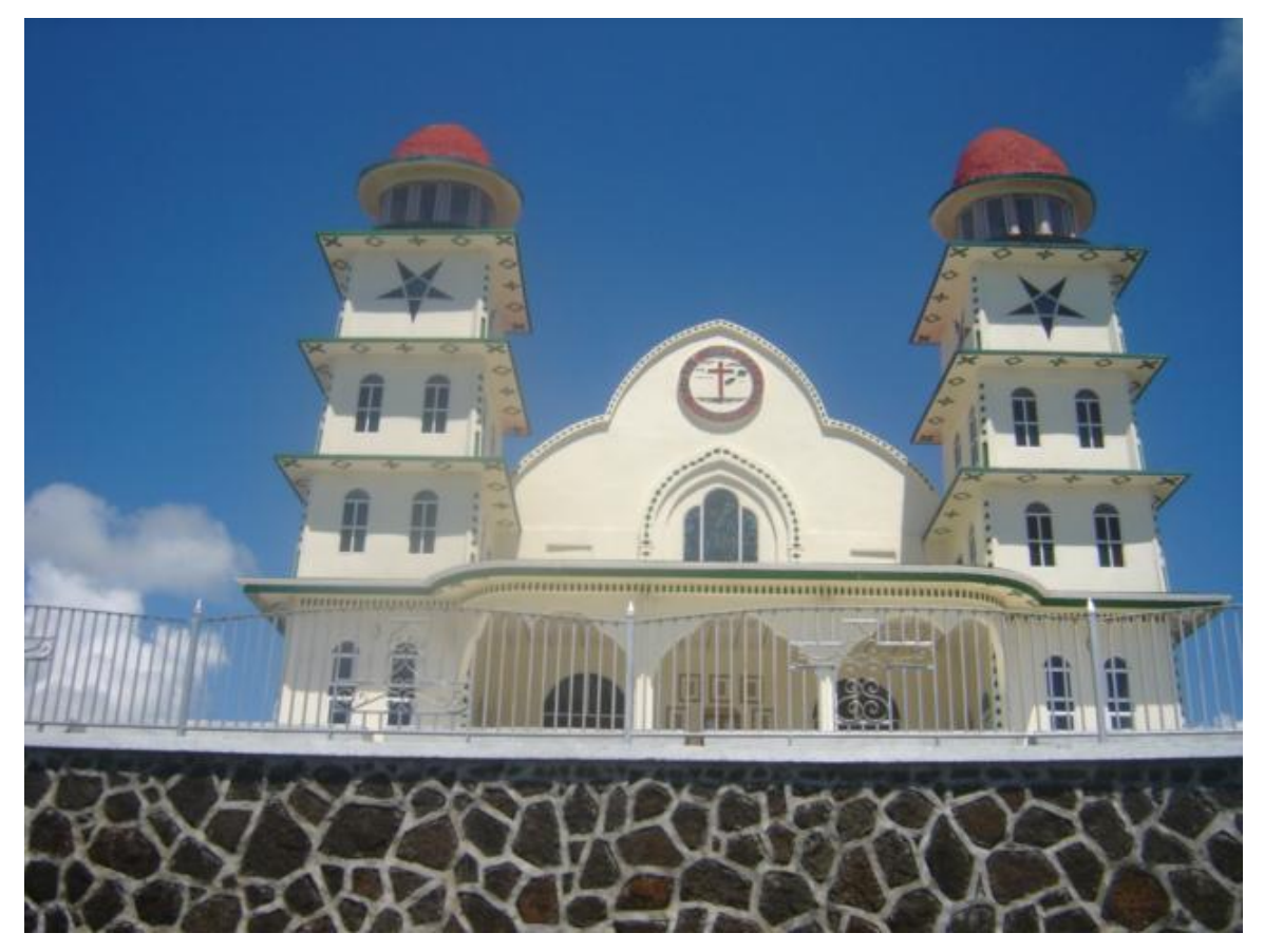
Picture 10: Congregational Christian Church of Samoa (formerly London Missionary Society) at Sapapalii, Savaii. (Where the missionaries first landed).

baptised the following year<sup>257</sup>. Although the London Missionary Society was interested in the Chinese from 1911, other denominations such as the Latter Day Saints, Methodists and Roman Catholics at the time had little to do with the Chinese<sup>258</sup>. This changed, however, in the late 1950s as more Chinese became Roman Catholics<sup>259</sup>.