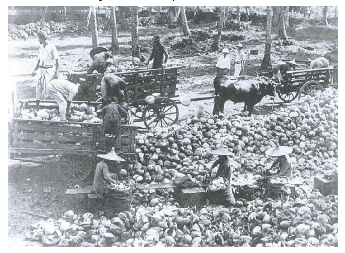
Picture 6: Chinese indentured labourers cutting copra. (Alexander Turnbull Library, Wellington, New Zealand).

As is discussed in the previous chapter, Chinese labourers faced extremely harsh working conditions. For plantation owners to fully exploit this labour source, thereby maximising profit, they needed to ensure low wages and high productivity. The use of short contract periods enabled the plantation owners to drive Chinese labourers into the ground as they knew they could repatriate anyone who was no longer productive and replace them with a new worker. There was no long term investment in this workforce and it was seen as a disposable commodity.