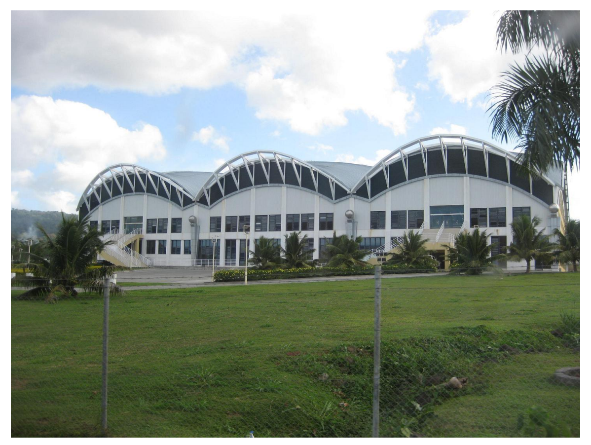
Picture 13: Sports complex in Samoa funded by Chinese aid. (Selma Scott).

China has contributed significantly towards the infrastructure development of Samoa. China funded the stadium which was used for the 1983 South Pacific Games, built new offices for the Prime Minister and all ministries in Samoa, funded the Women's Convention Centre, revamped Apia Park, and spent approximately $40 million on a sports facility when Samoa was to host the 2007 South Pacific Games<sup>307</sup>. Crocombe (2007) believes that these buildings can be viewed by China as symbols of power. He states "These nation symbols become monuments to China – in the same way that colonial governments built such emblems of their power"<sup>308</sup>. China may have established these symbols of power to portray to the world that they have made their mark in Samoa and similarly throughout the Pacific. China's main rival in the Pacific is Taiwan, as they compete against each other for the support of the Pacific Island nations. These Chinese monuments throughout Samoa and the Pacific can be seen by Taiwan as China marking its territory.