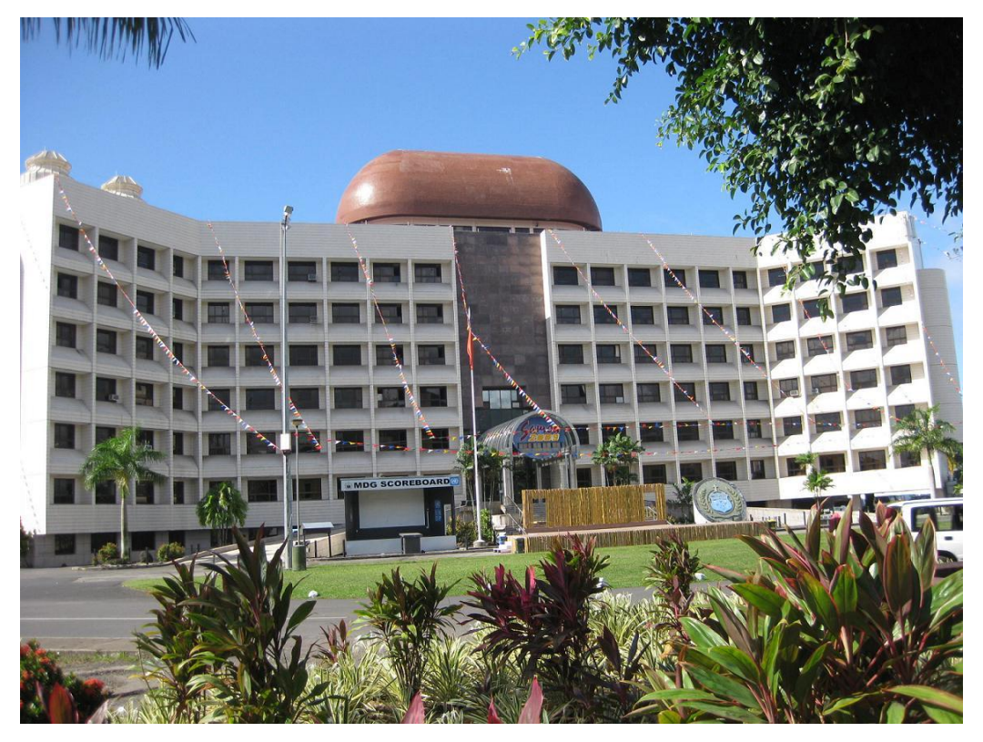
Picture 12: Government building in Samoa funded by Chinese aid. (Selma Scott).

Foreign aid is used in two main ways in Samoa; that is, for development projects and infrastructure projects. Takeda (1993) explains that development projects relate to agriculture, forestry and fisheries; and infrastructure-type projects relate to land, marines and aviation transportation<sup>304</sup>. An example of China's development projects in Samoa was the ten million Yuan loan project which was established after Samoan Prime Minister, Tupuola Efi, visited China in 1980; this project included two agricultural projects and a water supply project and was to be completed in 1988<sup>305</sup>. Japanese aid is used in Samoa and the Pacific mainly in fisheries, on marine research facilities, fisherytraining facilities and on training boats<sup>306</sup>. In contrast, Chinese aid in Samoa is more visibly focused on infrastructure enhancement.