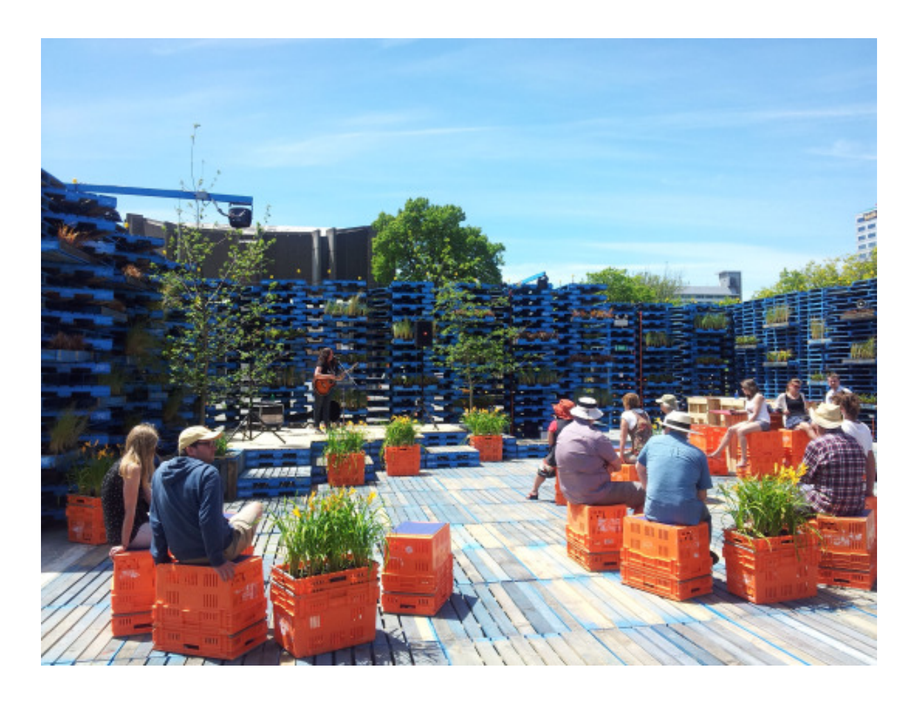
Figure 2: The Pallet Pavilion, June 2013