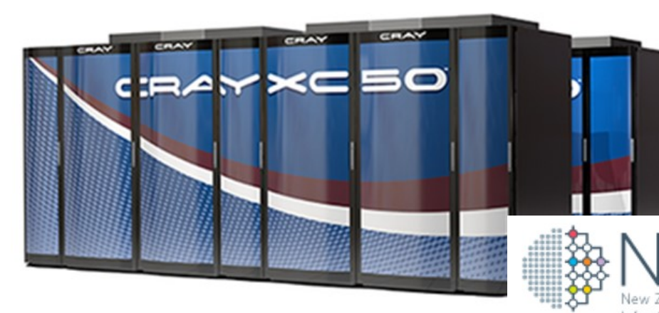
Maui / Kupe supercomputer

Maui is NeSI's leading capability machine. It is ranked as the world's 321 fastest supercomputer. It has 10,000 times the performance of Hypocentre; our local high performance workstation. Mahuika is an additional capacity resource that is useful for pre/post processing.