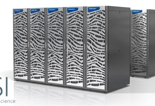
Mahuika Compute Cluster