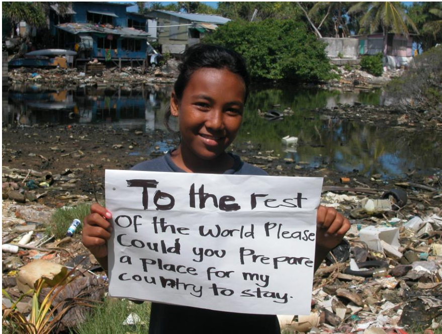
Figure 6: A girl with a “To the rest of the world” survival message from Tuvalu

slow responses from other agencies in the region.