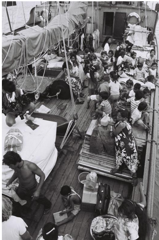
Figure 2: Nuclear refugees from Rongelap on board the Rainbow Warrior bound for Mejato atoll in 1985