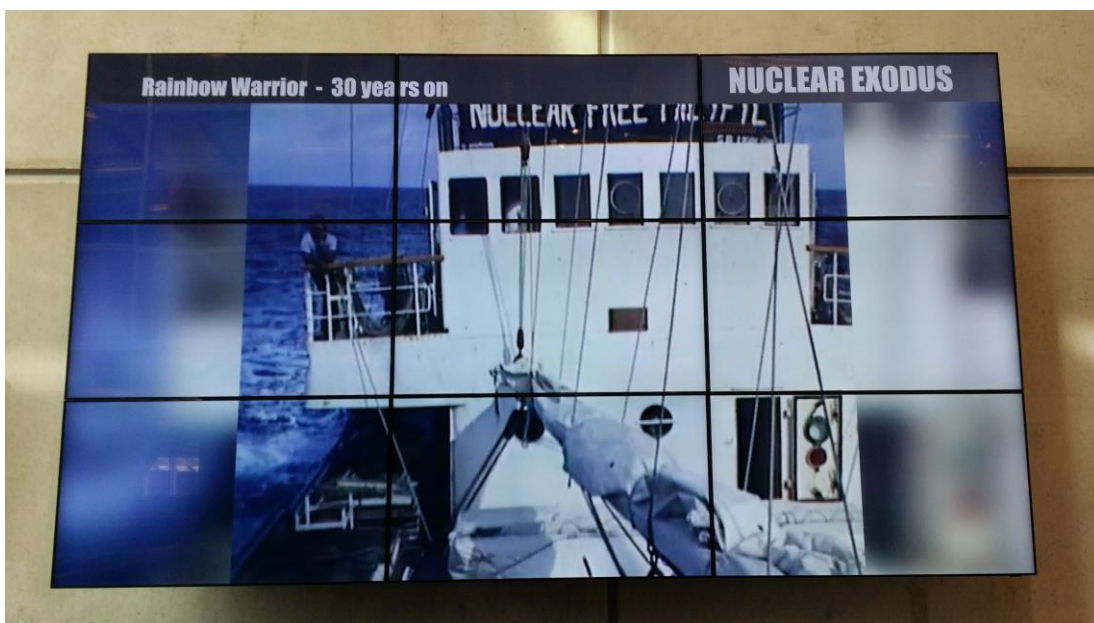
Figure 4: A scene on board the Rainbow Warrior with nuclear refugees bound for Mejato from the Eyes of Fire multimedia microsite project in May 2015.