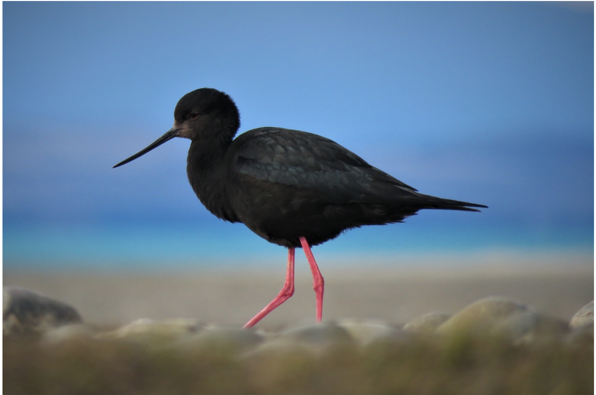
Figure 1. An adult kakī in the Tasman Valley of Te Manahuna. Image courtesy of Liz Brown. Shared with permission.