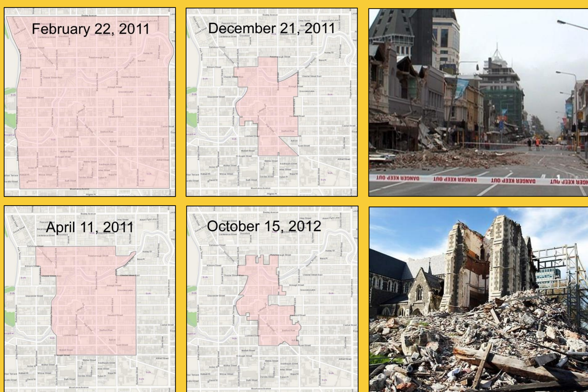
Figure 1 Devastation after 2011 earthquake in Christchurch, New Zealand and the different phases of established cordons

Methods: Coded in Nvivo and analysed Inductively