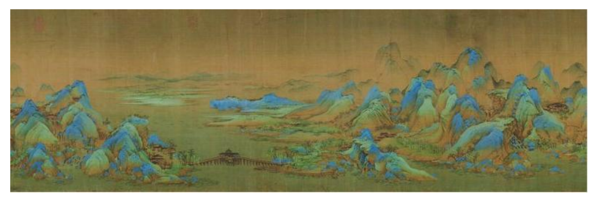
Figure 27: Part of the Qianli Jiangshan Tu (Wang Ximeng, The Northern Song Dynasty (960-1127)

Gradually, changes are occurring though. The modern side of China was displayed for the first time in a Hollywood blockbuster in the third sequel of the Mission Impossible film series, Mission: Impossible III (J. J. Abrams, 2006). One third of the film takes place in Shanghai, the most modern city in China in terms of urban development and architecture. However, the film still combines the traditional and exotic sides of China in the scenes in Xitang, a small water town in the Zhejiang Province near Shanghai. The audience sees Tom Cruise not only in the prosperous metropolitan cityscape of Shanghai (Figure 28), but also in the bustling alleys of the water town with its Chinese-style houses, stone bridges and flowing water (Figure 29). Because the modern side of Shanghai had for the first time appeared in a mainstream Hollywood blockbuster, the news was reported widely in China, and the filming in Shanghai became one of the selling points of the film, which helped it list within the top 10 grossing films of 2006 in China. Owing to Tom Cruise's dangerous leap from the 53-storey Bank of China Tower to its adjacent Tower of China Pacific Insurance Company, John Berra notes "the jaw-dropping stunt executed in Mission: Impossible III established the city as a prime location for global spectacle."<sup>3</sup>