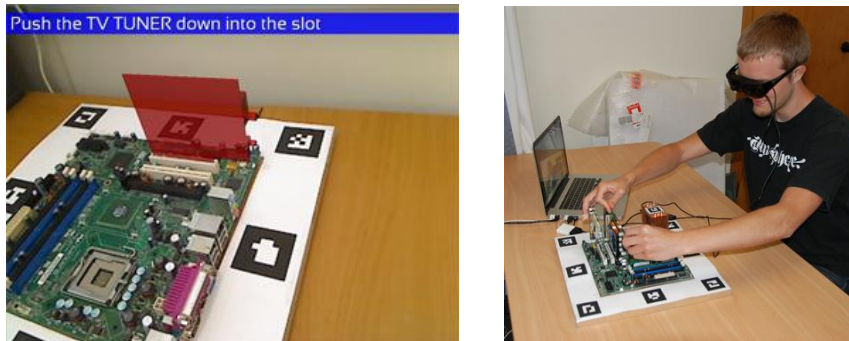
Fig. 2. a) First-person view of the AR display for part of the TV tuner installation task. The red-colored 3D model indicates where the component should go. b) A participant using the tutor

Figure 2.a shows a first-person view of the display for the TV tuner installation task. The insertion animation is not visible in the picture. The models were then animated to illustrate the proper installation procedures. For example, the graphics card is visibly pushed downward into the PCI express slot, and the processor enclosure is opened before the processor is inserted. The animations were embedded into the exported 3D model files, which can be loaded directly into the display module by the appropriate plug-in in the OpenSceneGraph software library.