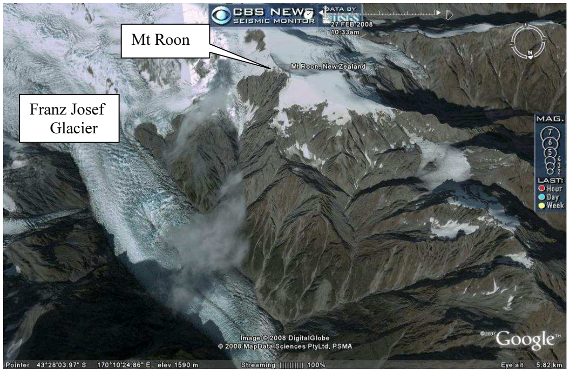
Supplementary Data Figure 3(b) Google Earth view of east face of Mt Roon