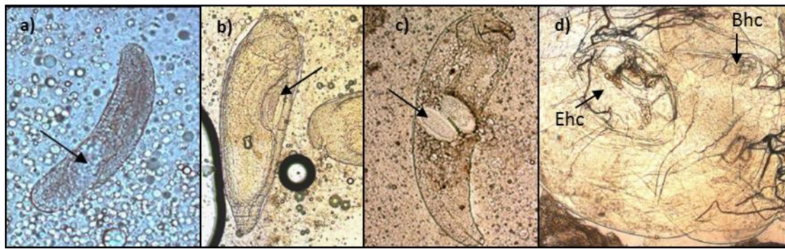
Fig 2 Baeoanusia albifunicle eggs within a) 16 h old E. nassau egg (maintained at 22°C), b) early-instar E. nassau larva, c), mid-instar E. nassau larva. d) B. albifunicle larva developing within late instar E. nassau (Ehc = E. nassau head capsule, Bhc = B. albifunicle head capsule)