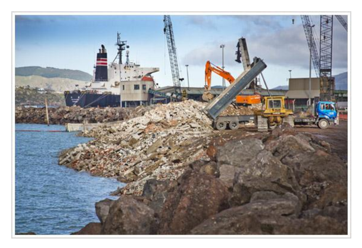
Figure 3-2 Te Awaparhi Reclamation (Lyttelton Port of Christchurch, 2011a)