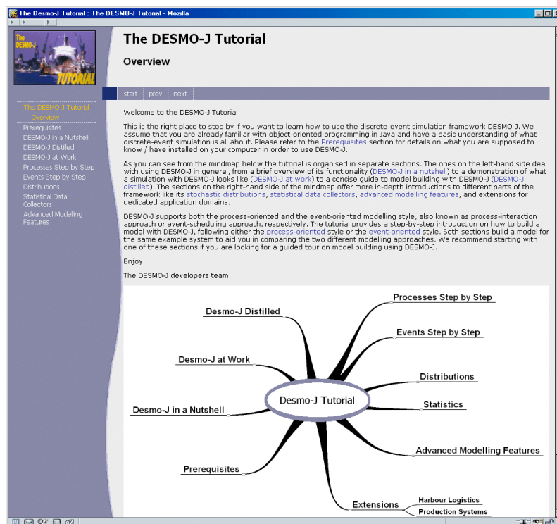
Figure 1: Entry page to the DESMO-J Tutorial

sections. The ones on the left-hand side deal with general issues of DESMO-J's usage. This includes a brief overview of its functionality ( DESMO-J in a nutshell ), a demonstration of what a simulation with DESMO-J looks like ( DESMO-J at work ), and a concise introduction to building a DESMO-J model ( DESMO-J distilled ). The right-hand side sections offer more in-depth discussions of different parts of the framework (i.e. statistical data collectors, stochastic distributions, advanced modelling features) and extensions for special application domains (e.g. harbour logistics).