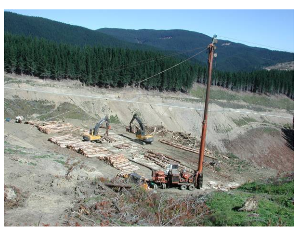
Figure 1: A typical (cable yarder) skid-site that incorporates all the extraction, processing and loading out phases of the operation.

'Skid': A skid is by far the most common landing type. It will typically just service one harvesting crew and accommodate all processing, storage and loading functions (Figure 1).