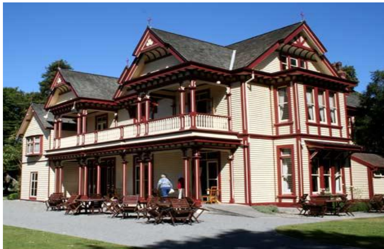
Figure 4. Riccarton House in its current state as a museum, café and wedding venue.

The wish of John Deans I and the gifting of Putaringamotu/Riccarton Bush to the people of Christchurch has ensured that the Bush remains relevant and significant to the city. The Trust has worked hard to protect and conserve the area of native Bush and recognises the significance of the Bush to the history of Christchurch. The Trust therefore acknowledges Putaringamotu/Riccarton Bush's connection to Canterbury's environmental, Maori, pioneering and heritage history. The transformation of the Bush from a wilderness to a native reserve has also ensured that it remains significant within Christchurch both as a tourist attraction and as a meeting place for locals.