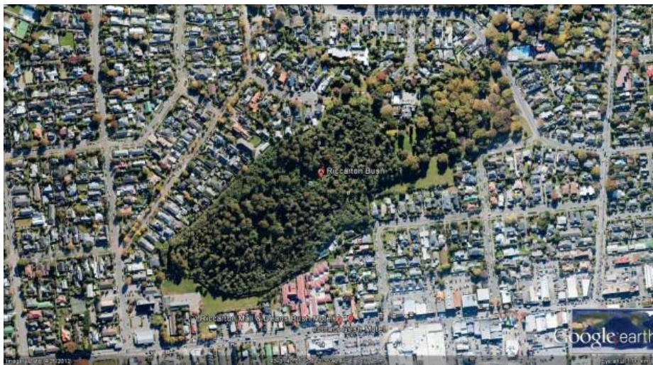
Figure 3. Aerial photograph of Putaringamotu/Riccarton Bush, 2015.

significant place in Christchurch where people could go to enjoy its natural beauty and fully appreciate the significance of the native Bush. The opening of the Bush acknowledged its place within Christchurch's history with regards to its environmental significance, as well as its importance to the city's pioneering beginnings. The historical significance of the Bush and its place as a conservation area for the public to visit and enjoy was furthered in 1947 with the purchase of Riccarton House and its surrounding gardens.