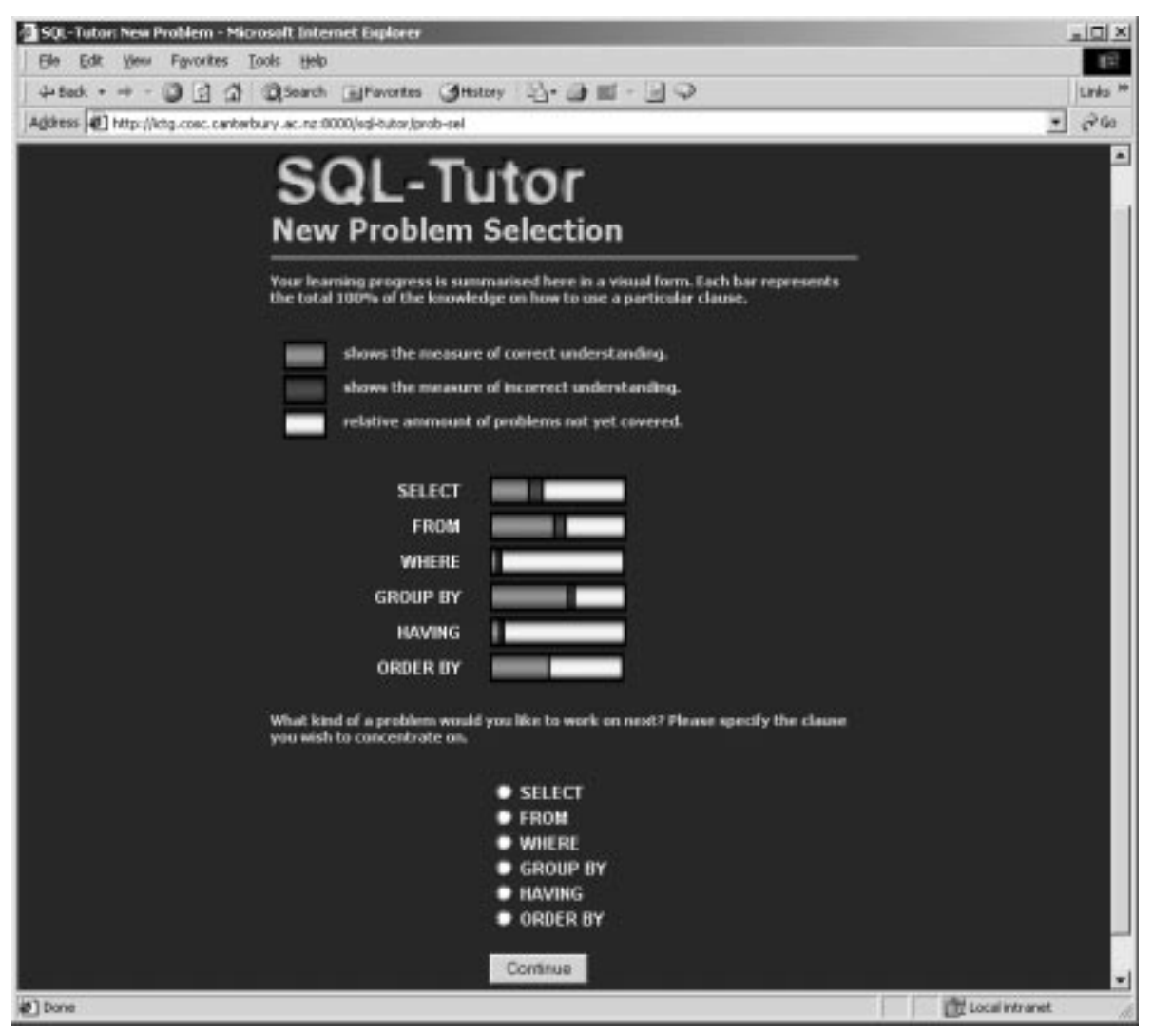
Fig. 1. The problem selection page from SQL-Tutor

The three versions of the system used in the study support different problem selection strategies. In the first version, the system selects the appropriate type of problem for the