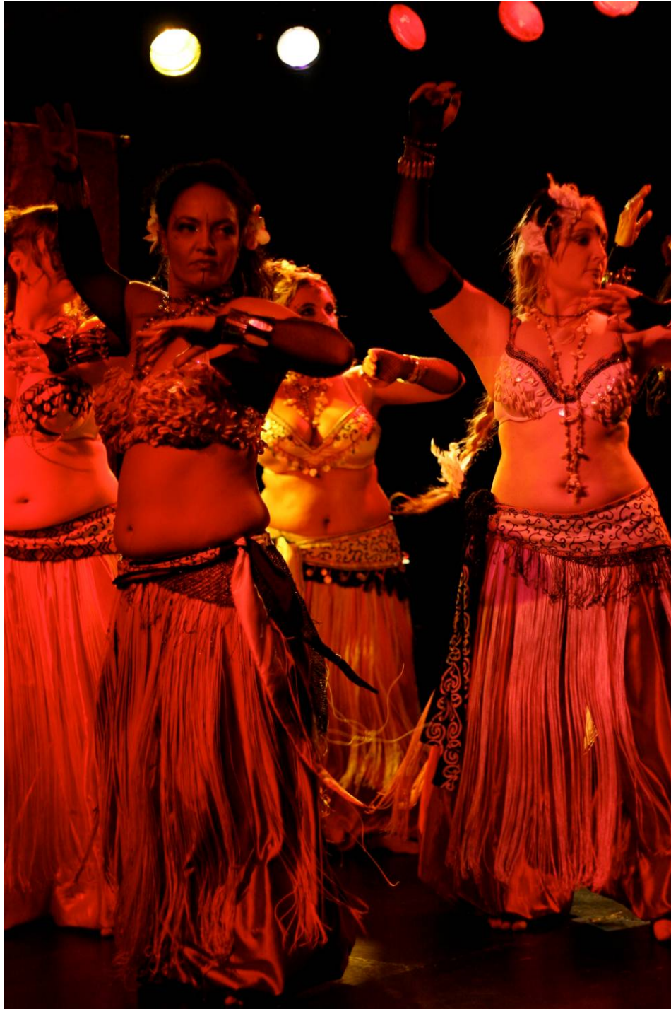
Fig 10: Kiwi Iwi evoke retro Kiwiana and traditional Maori performance costuming in a dance to 'Tangaroa' by Maori musician Tiki Tane.