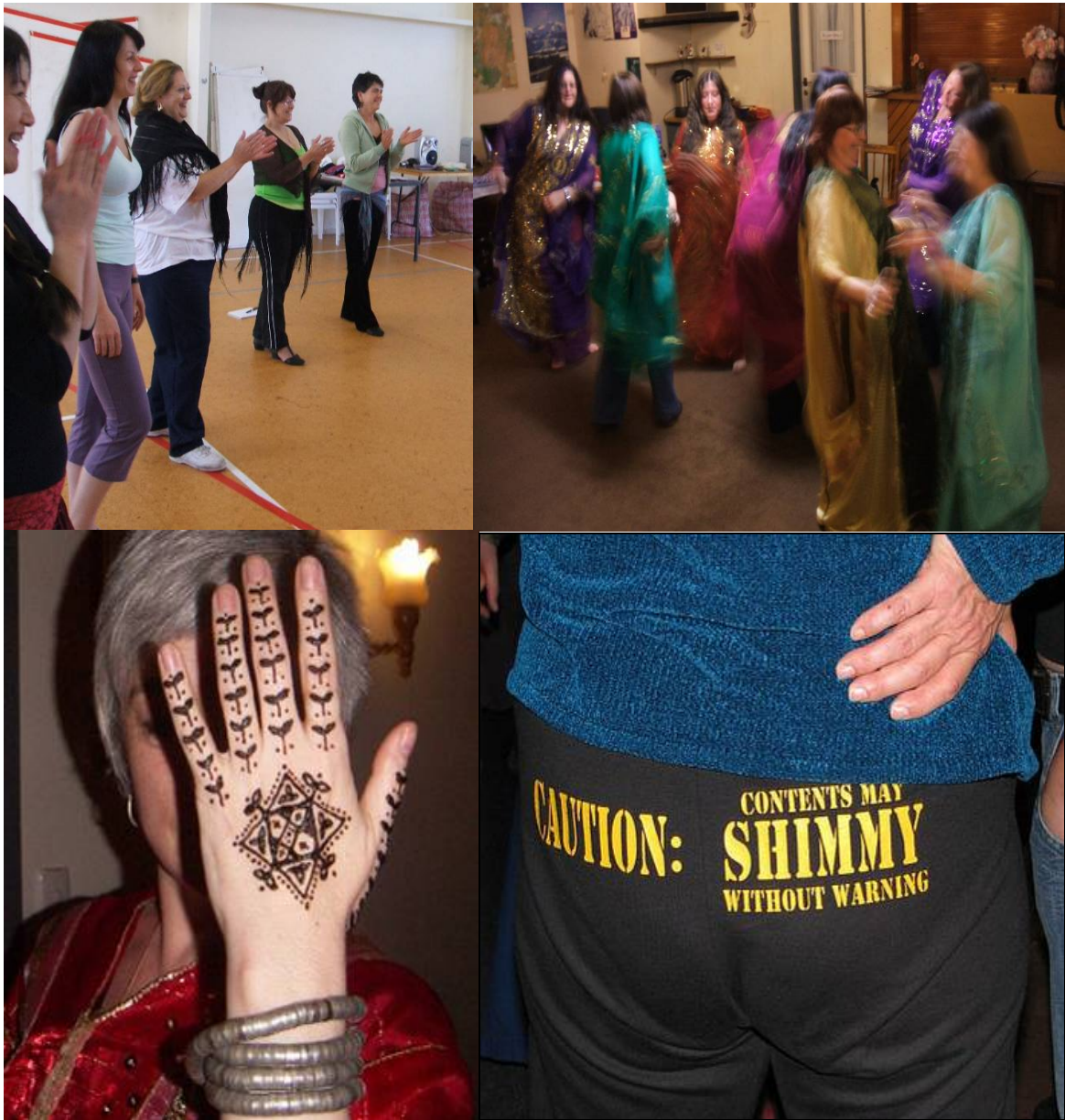
Figure 2: Globalised belly dance at Oasis Dance Camp. Clockwise from left: dancers dressed for workout in class; partying in Gulf-style dresses; workout gear customised for belly dancers; Berber-inspired fantasy henna.