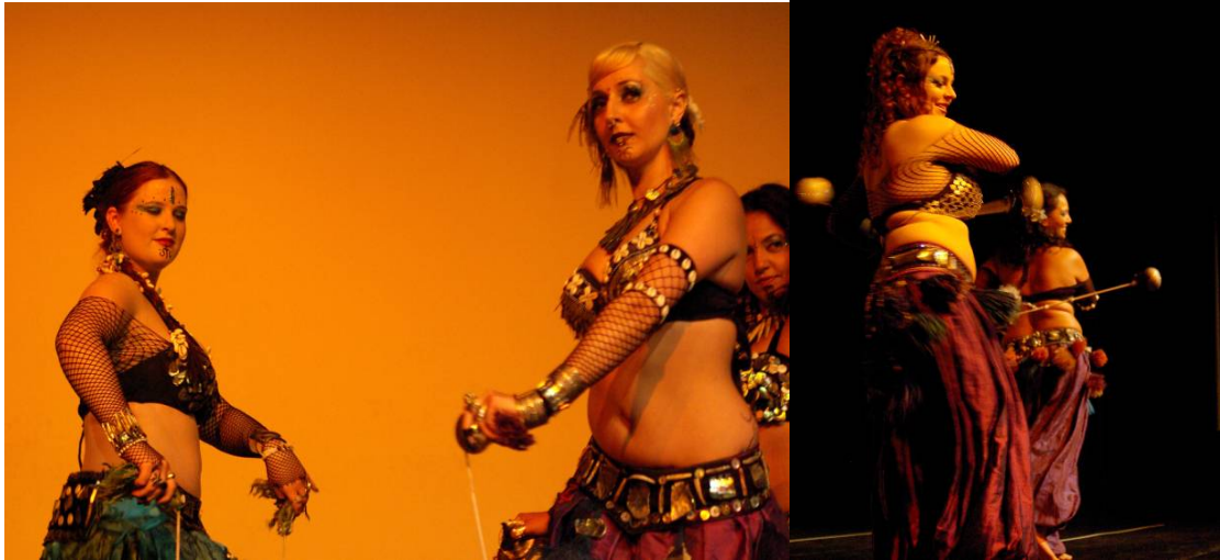
Figure 8: Paua, poi, Pacific colours and fantasy moko in the Pacific fusion belly dance of Kiwi Iwi