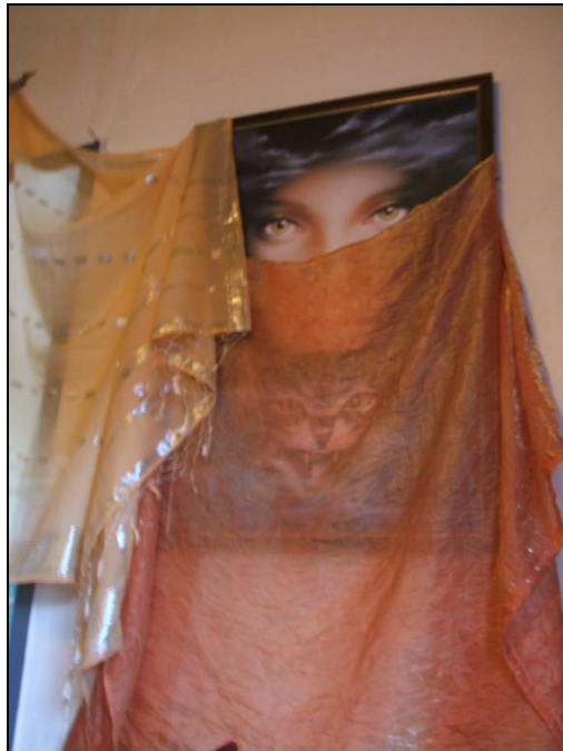
Figure 7: "Harem" solution to unwanted decor, Oasis Dance Camp.