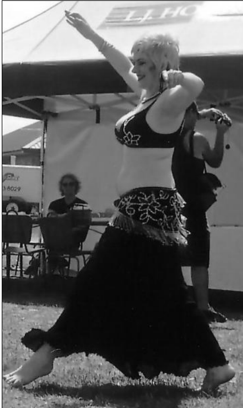
Figure 1: Myself, dancing on grass at the Brooklands Gala