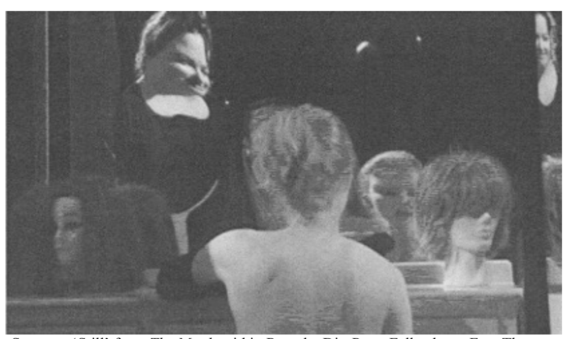
Source – 'Still' from The Maids within <u>Remake</u> Dir. Peter Falkenberg. Free Theatre, 2007.