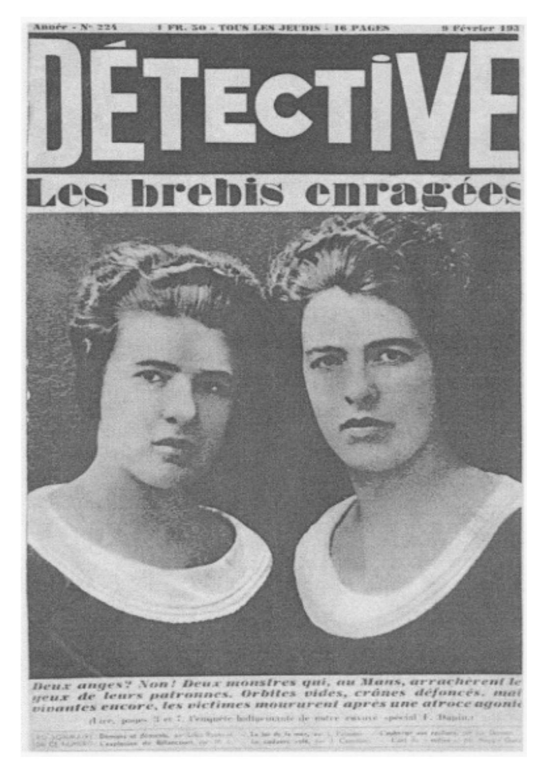
Source - "L'affaire Des Soeurs Papin." Les Temps Modernes , no. 210 Novembre (1963). By Dr Louis Le Guillant.