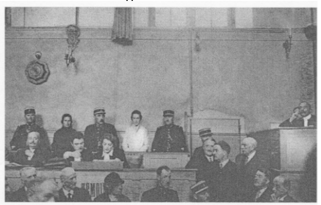
E: Source - "L'affaire Des Soeurs Papin." Les Temps Modernes , no. 210 Novembre (1963). By Dr Louis Le Guillant.